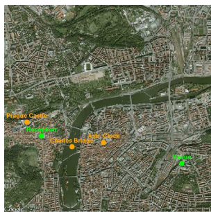
FIGURE 2. Caption text BELOW the figure.