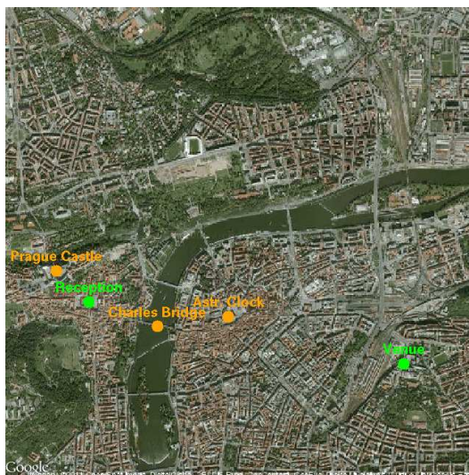
FIGURE 1. Caption text BELOW the figure.